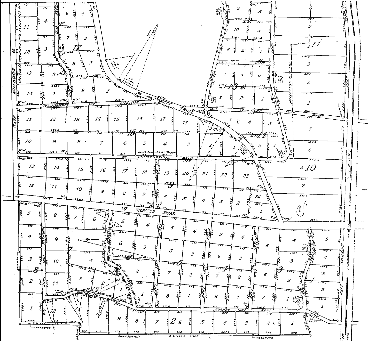
MAP OF WESTFIELD A A SUBDIVISION BY R. NILES GRAHAM, ET AL., OF A PART OF SPEAR LEAGUE, TRAVIS COUNTY TEXAS SCALE 1/4" = 100' ENFIELD REALTY & HOME BUILDING COMPANY AUSTIN TEXAS C. S. LANGR, SURVEYOR, JULY 1924

For Restrictions see vol. 68 page 141 Deed Records Travis County